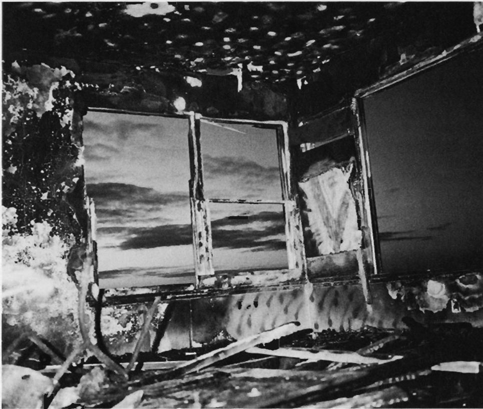
John Divola, From Zuma series #29, 1978 (original in color)

We are magically offered different realities in the same space, encountering opportunities to see, to perceive, and to discover.